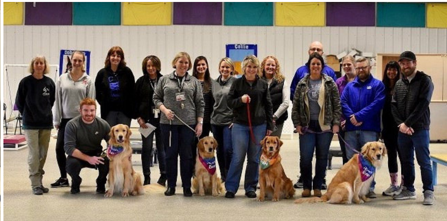
The first 4 Circle Tail Facility Dogs to be placed in local schools