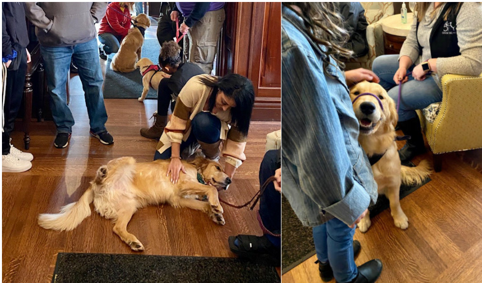
Therapy dog Liam and Facility dog in training Breslin enjoying some love at the Dragonfly open house