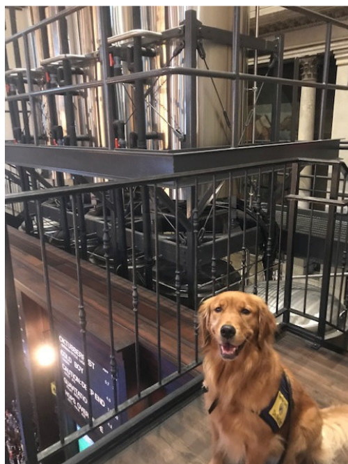
Facility dog in training Cygni at Taft's Ale House