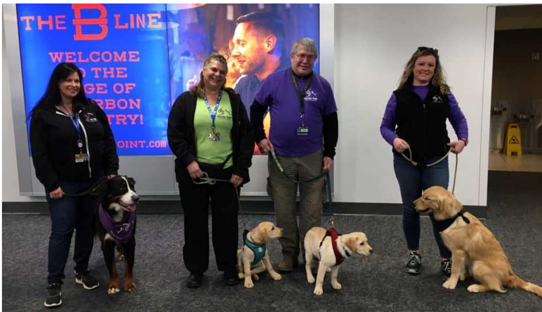
Volunteers take facility and service dogs in training to CVG