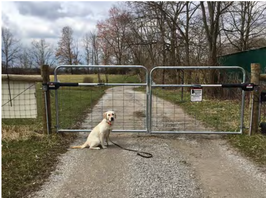
Kennel entrance with new electric gate

Our upgrades this year made Circle Tail a more inviting, comfortable and safer place for the humans and dogs.