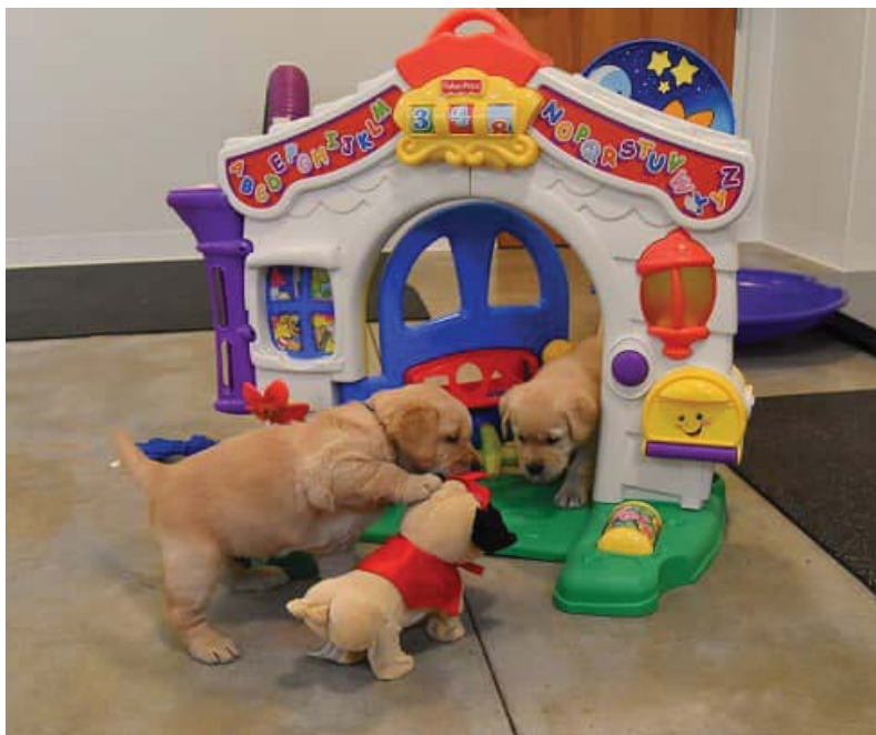
Maui pups in puppy playroom