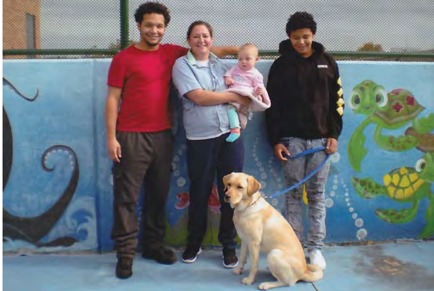
SDIT Quizz and her inmate handler and family on Family Day