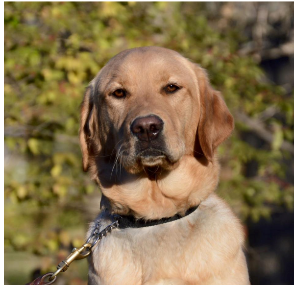
ADI Coop pup Rani

In the last quarter of 2014 Circle Tail became a member of Assistance Dogs International (ADI) Breeding Cooperative. This Cooperative consists of ADI members who either have large or small breeding programs, those who would like to assist organizations who have breeding programs by whelping litters for them, or who would just like to receive puppies when available. Circle Tail joined at the Host Level which enables us to assist the cooperative by whelping litters from other organizations. This year we received 3 pups through the cooperative: Legend, black lab male, Flex, yellow lab male, and Kimmel, black lab male. We also partnered as a service dog, Rani, who was the first ADI Breeding Cooperative dog that we received.