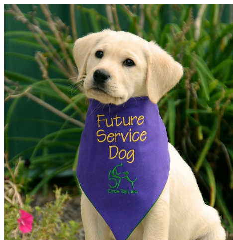
Service pup in training Elsa