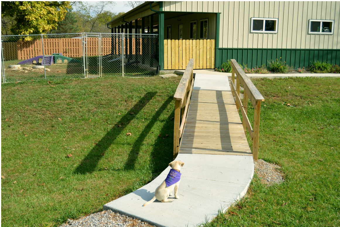
Service dog kennel with fenced yard and bridge to training center

An automatic door opener was installed for the accessible bathroom at the training center to provide easy access for our clients in wheelchairs.