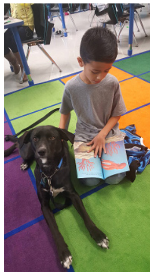
School Therapy Dog Corr