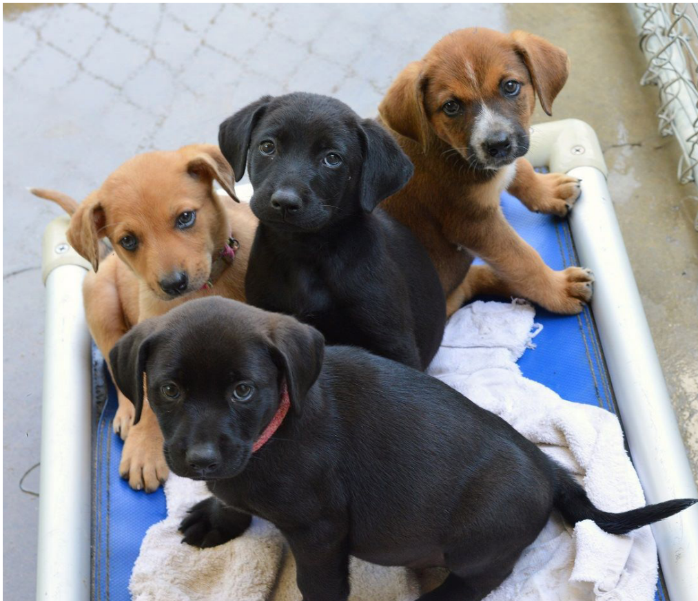
A few of the pups who have benefitted from the on-site surgery suite