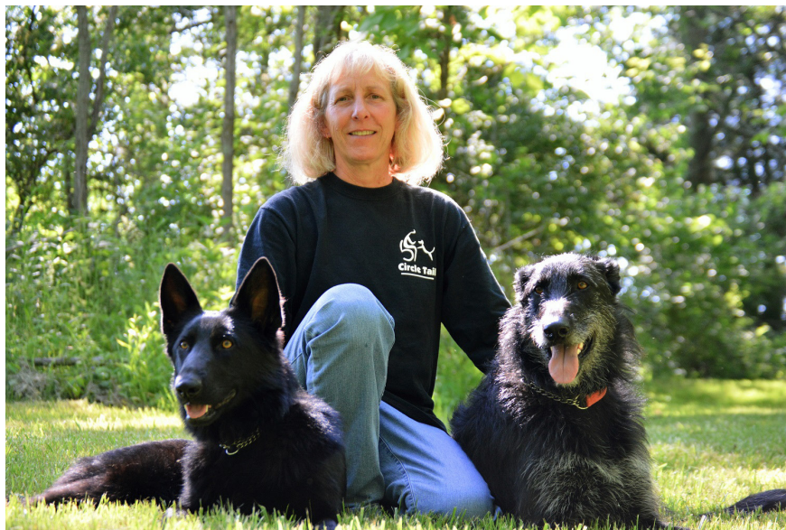
Executive Director, Circle Tail, Inc.

2016 was an exciting year of program growth for Circle Tail. We began the foundation of our Diabetes Alert Dog (DAD) program by educating our donors and the public about this unique type of service dog, acquiring some new pups for that purpose and education for our staff. The scent lab for training the DADs was up and running by fall and we instituted a Nosework class for the public. Some changes to improve our service dog training and placement rate were more difficult for us to implement, such as decreasing intake of dogs strictly for adoption and eliminating boarding as a service we provide to the public. Our focus narrowed so we could provide the pups and dogs on site more variety of experiences and training on a daily basis. We also purchased multiple pups to improve our success rate with our service/hearing dogs and to look to the future of a breeding program. Improvements around the service dog kennel made for a safer, cleaner and more time efficient year. Improvements included additional sidewalks, fencing and gates, as well as a bridge on the way to the training center. We ended 2016 with approximately 60% more service/hearing dogs in the training program than at the start. We thank all of our donors, volunteers, and staff that helped make this truly a year of growth for the service/hearing dog program and look forward to an even more promising 2017.