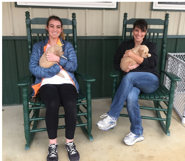
Volunteers helping to socialize pups