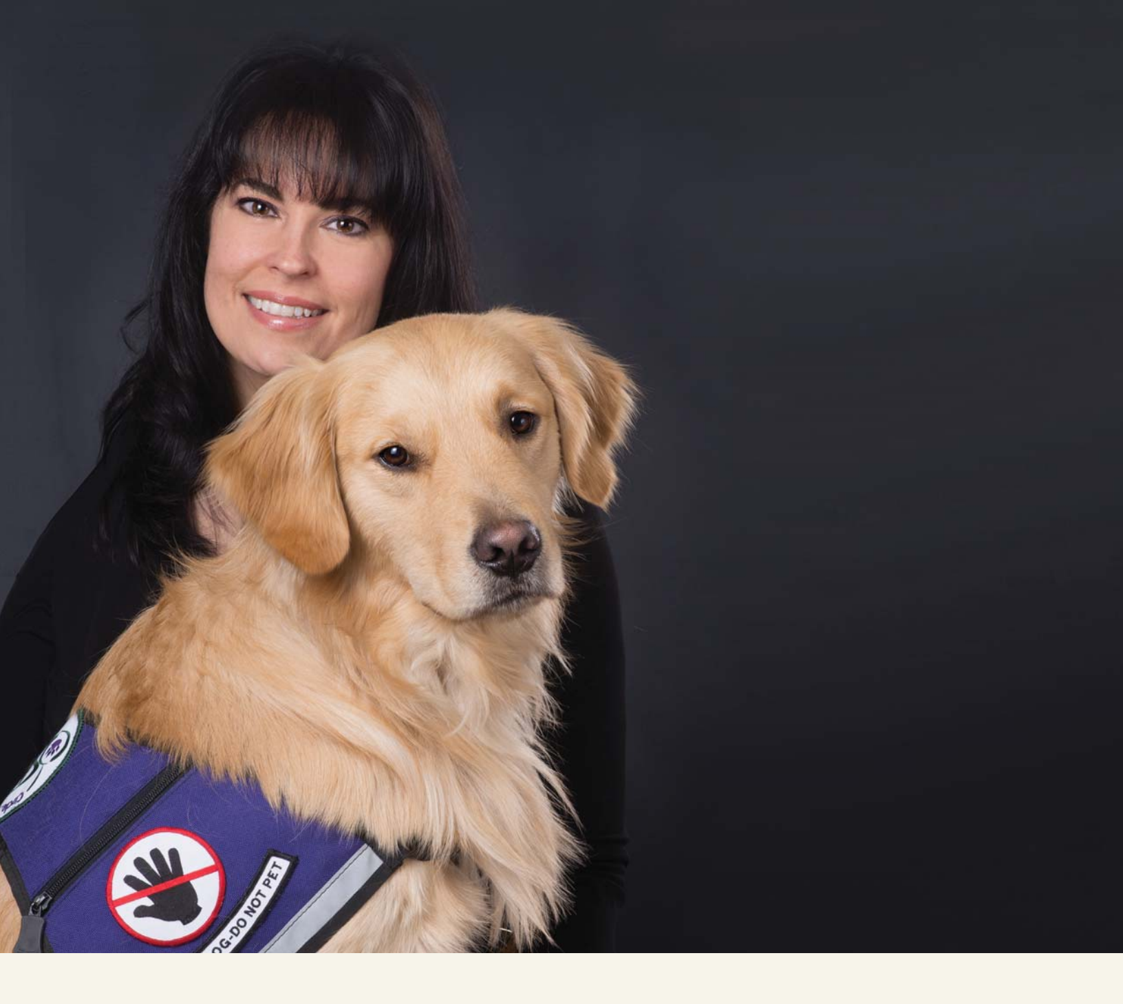
Circle Tail, Inc. People Helping Dogs Who Help People