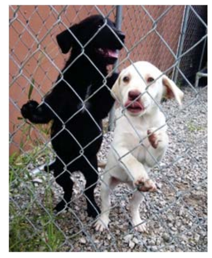
Lab mix pups waiting to be adopted