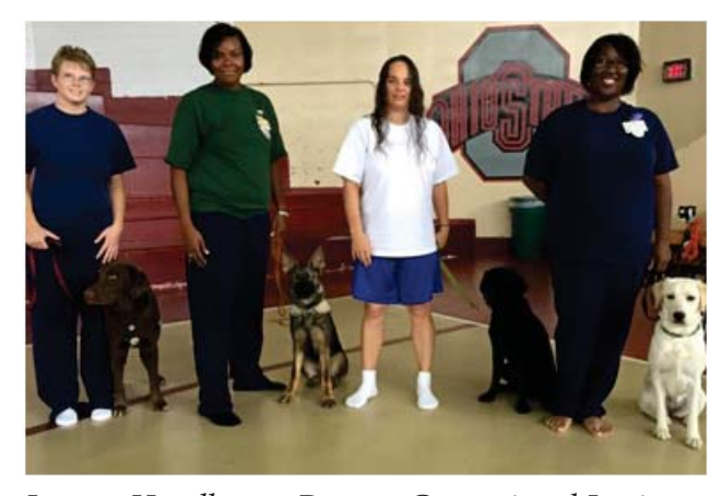
Inmate Handlers at Dayton Correctional Institute