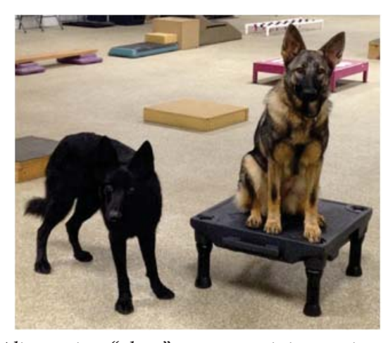
Ali practices "place" on new training equipment