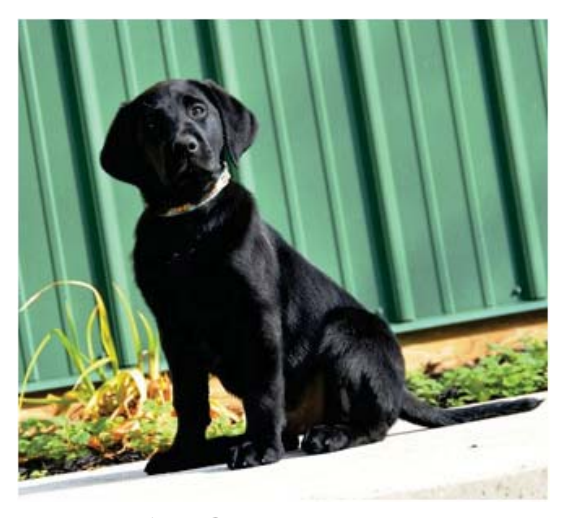
ADI Coop pup Venture

In the last quarter of 2014 Circle Tail became a member of Assistance Dogs International (ADI) Breeding Cooperative. This Cooperative consists of ADI members who either have large or small breeding programs, those who would like to assist organizations who have breeding programs by whelping litters for them, or who would just like to receive puppies when available. Circle Tail joined at the Host Level which enables us to assist the cooperative by whelping litters from other organizations. We had the opportunity to do that this year as we hosted a whelp for the Guide Dog Foundation (GDF). GDF Quinta had 6 pups. Circle Tail was able to retain 1 male and 1 female pup for service work, and 1 male pup who had an eye defect. We will look at this pup for either an in home service dog or therapy dog. Additionally, we received 2 other male Labrador retriever pups and 1 female lab/golden retriever cross. Through the Cooperative we have been able to obtain more puppies for the service/hearing dog program. As the number of suitable dogs for service work declines in our area shelters, this program will help Circle Tail grow the number of service/hearing dog placements in years to come.