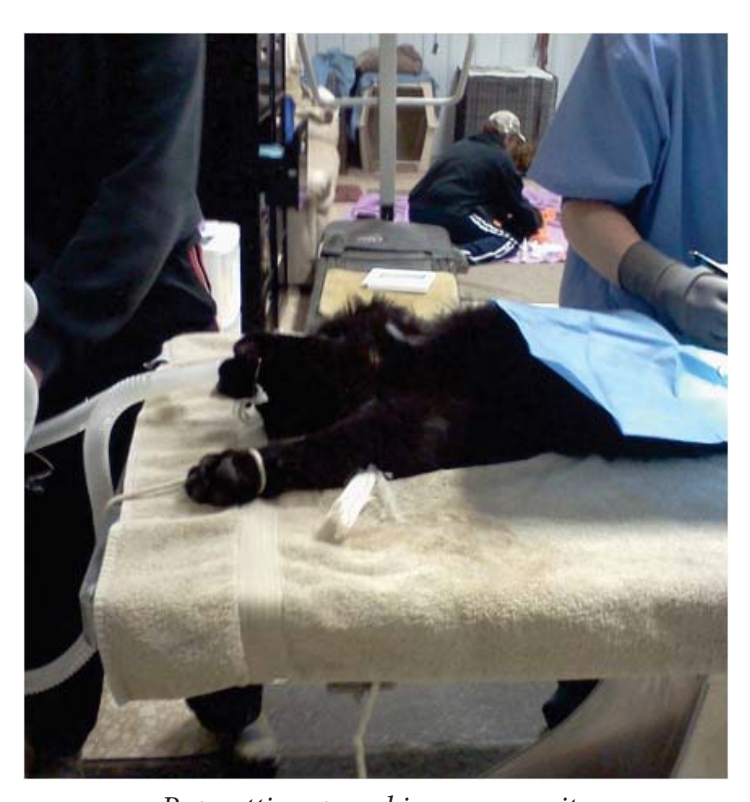
Pup getting spayed in surgery suite