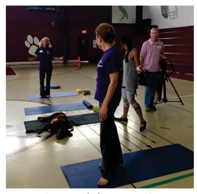
Getting ready for Yoga at DCI