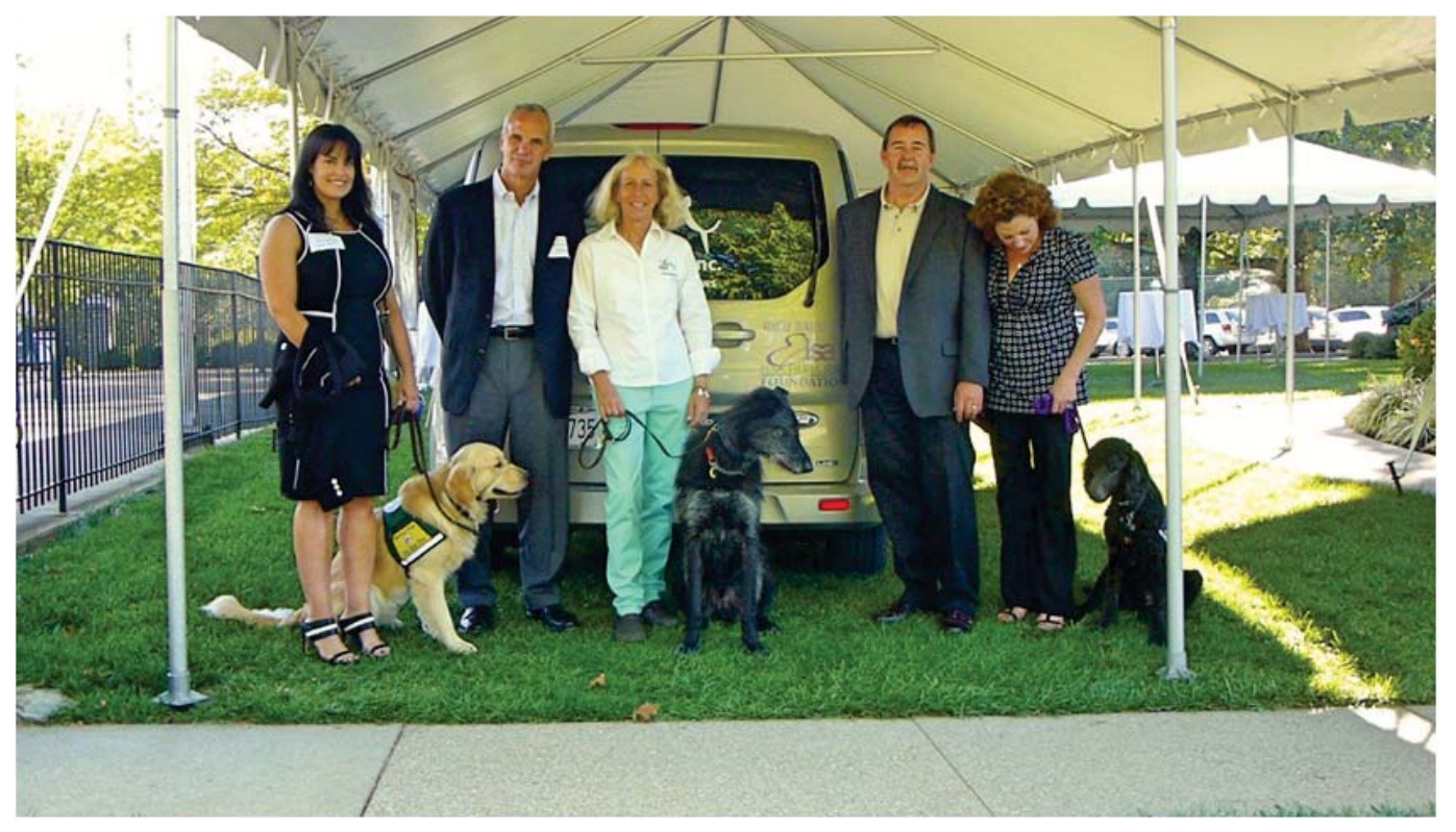
Displaying the van during the celebration of the life, legacy, and gifts of Elsa Heisel Sule