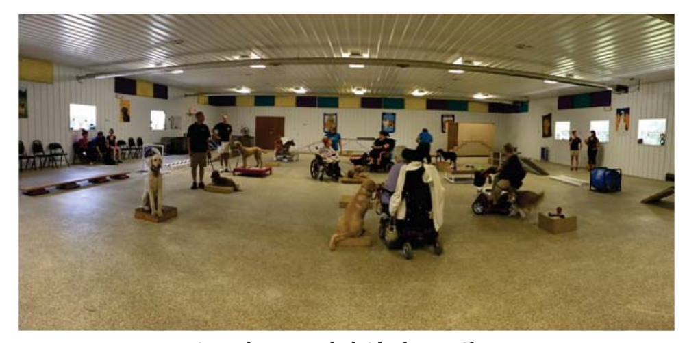
Saturday Remedial Obedience Class