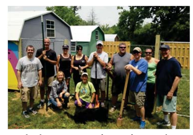
Board Members and volunteers put up fencing for new play yards for the dogs!