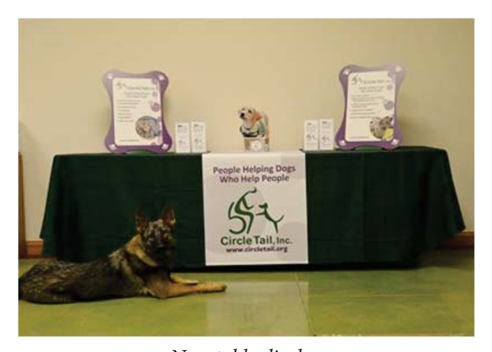
New table display

The Marketing Committee completed a media kit in both printed and web formats. This information is now available for staff, board members and volunteers to share with media personnel or others in the community who are interested in a thorough overview of the programs of Circle Tail. A new tabletop display was professionally created and donated to Circle Tail for use at presentations and other off site events. The display enhances the image of our organization and details the services and volunteer opportunities at Circle Tail.