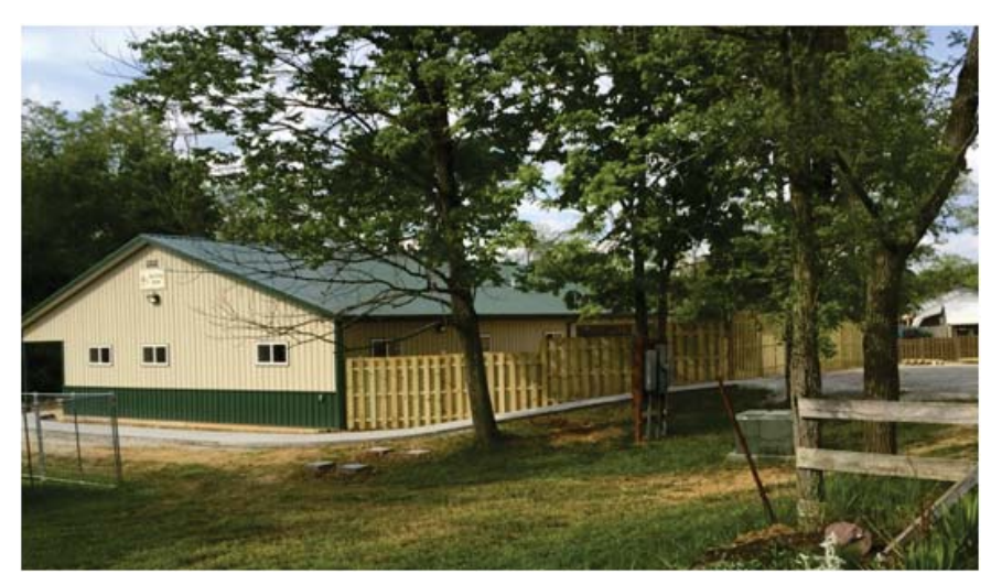
Privacy fencing and sidewalk by service dog kennel

The new Center for Service and Hearing Dogs finished construction in late 2014. In 2015, privacy fencing was installed along the driveway and a sidewalk from the parking area to the porch was completed.