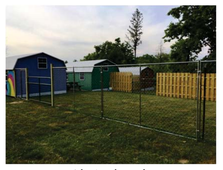
Adoption play yards

Two fenced play yards were added off the adoption buildings to allow for off leash play with the dogs for adoption and their perspective families. These areas enhanced the adoption experience by allowing potential adopters to interact with the dogs without walking a great distance. When the yards are not in use with adopters, the kennel staff uses the yards to exercise the shelter dogs and even some of the service pups in training.