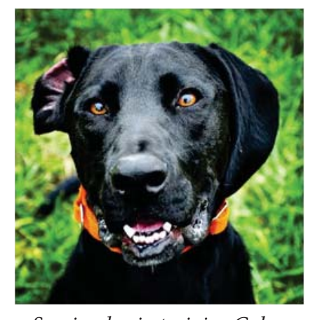
Service dog in training Cuba