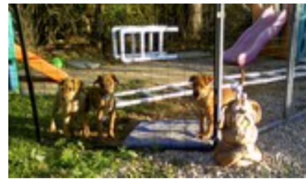
Hanging out in the new puppy play yard!

Thank you P&G Pet Care friends and sponsors ! These folks worked hard to make some amazing improvements to the Circle Tail grounds and buildings. Volunteers, come check out the changes! And if you're interested in becoming a new volunteer, email volunteer@circletail.org .