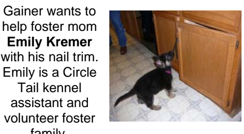
Service puppy in training, Mission, practices opening a cabinet.