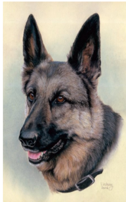
Abby, First Lady of Circle Tail

Circle Tail celebrated our 15th Birthday on February 6! Thank you to all the volunteers who've helped make our programs successful!