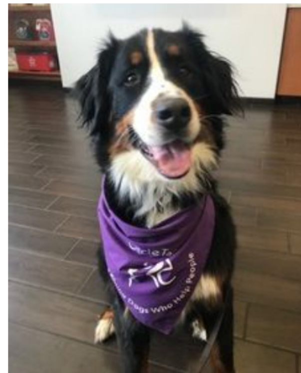
Circle Tail Ambassador Ozone spreads smiles at Beechmont Toyota

Check out Circle Tail's CALENDAR for: Pet First Aid classes, dog training classes, campus tours, community education events, and fundraising events!