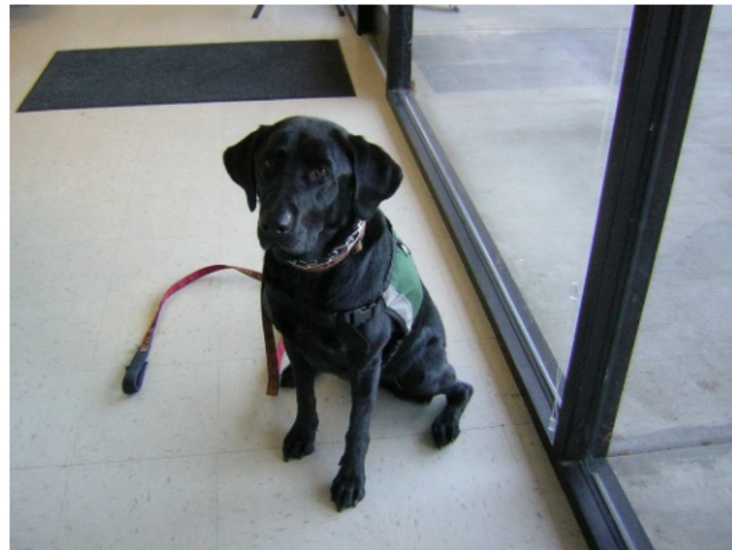
Nixa at the store