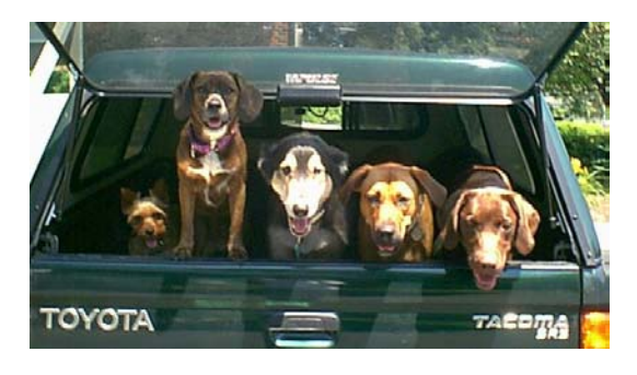
From left to right: Oz, Henna, Tarka, Sabaka, Nestle

Volunteers are always needed for many different functions at Circle Tail. Whether it is working with the dogs or on the administrative side, there's an opportunity for you! See www.circletail.org or call (513) 877-3325 to learn about volunteer opportunities!