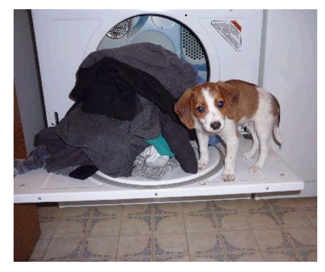
Service dog in training, Gromit, is happy he was rescued after being dumped by the road. Now he wonders, what am I supposed to do with all this laundry?!