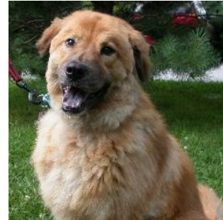
Foster Dog, Antiaua

"My three daughters (ages 16, 18, and 20) and I have all learned a lot from fostering. We started fostering dogs for two reasons: 1) one of my daughters had always wanted a large dog, and 2) I have a degenerative eye disease, which means I may need a service dog myself someday. I have never had a big dog and am not a "dog person" at all. So my daughter and I decided this would be a good way to "try out" having a large dog.